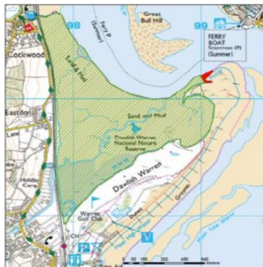
Proposed Dawlish Warren Voluntary Exclusion Zone